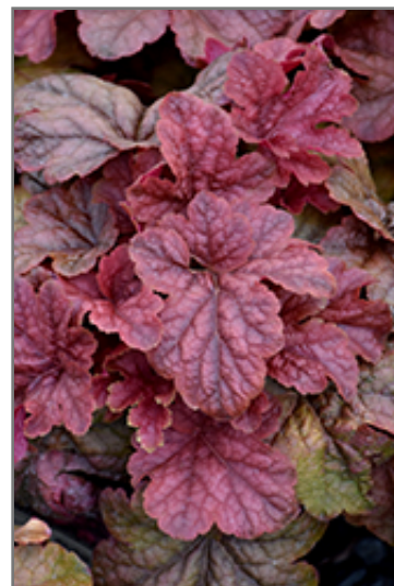
Peach Tea Foamy Bells foliage