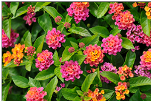
Bloomify Rose Lantana flowers

Bloomify Rose Lantana is recommended for the following landscape applications;