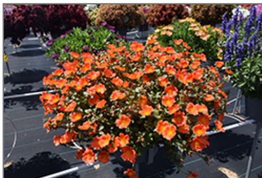
Mega Pazzaz Orange Portulaca in bloom