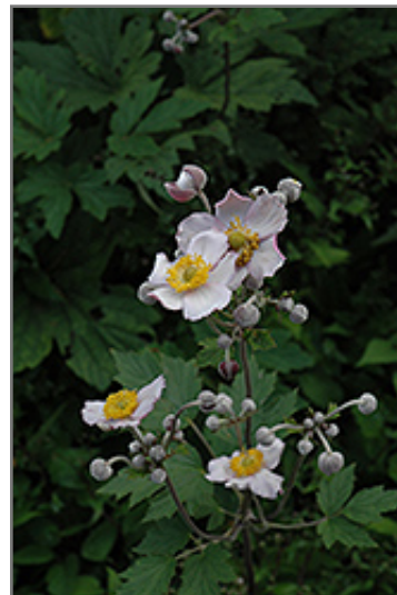
Grapeleaf Anemone flowers