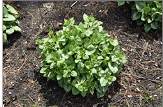
Jack of Diamonds Bugloss

Jack of Diamonds Bugloss will grow to be about 14 inches tall at maturity, with a spread of 30 inches. When grown in masses or used as a bedding plant, individual plants should be spaced approximately 28 inches apart. It grows at a medium rate, and under ideal conditions can be expected to live for approximately 10 years. As an herbaceous perennial, this plant will usually die back to the crown each winter, and will regrow from the base each spring. Be careful not to disturb the crown in late winter when it may not be readily seen!