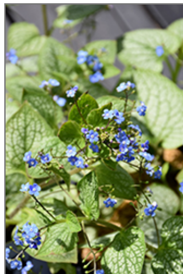
Jack of Diamonds Bugloss flowers