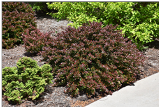
Concorde Japanese Barberry

Concorde Japanese Barberry is recommended for the following landscape applications;