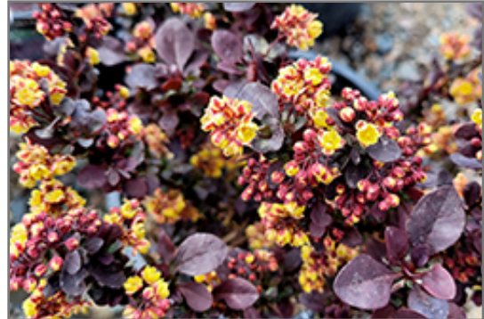
Concorde Japanese Barberry flowers

Concorde Japanese Barberry will grow to be about 18 inches tall at maturity, with a spread of 24 inches. It tends to fill out right to the ground and therefore doesn't necessarily require facer plants in front. It grows at a slow rate, and under ideal conditions can be expected to live for approximately 20 years.