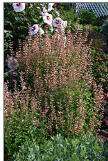
Meant To Bee Queen Nectarine Anise Hyssop in bloom

Meant To Bee Queen Nectarine Anise Hyssop is a fine choice for the garden, but it is also a good selection for planting in outdoor pots and containers. With its upright habit of growth, it is best suited for use as a 'thriller' in the 'spiller-thriller-filler' container combination; plant it near the center of the pot, surrounded by smaller plants and those that spill over the edges. It is even sizeable enough that it can be grown alone in a suitable container. Note that when growing plants in outdoor containers and baskets, they may require more frequent waterings than they would in the yard or garden.