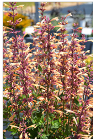
Meant To Bee Queen Nectarine Anise Hyssop flowers

Meant To Bee Queen Nectarine Anise Hyssop is recommended for the following landscape applications;