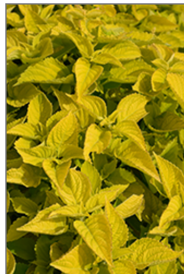
Chartres Street Coleus foliage

Chartres Street Coleus is recommended for the following landscape applications;