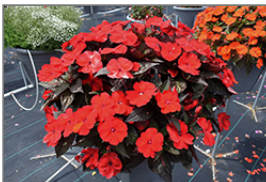
SunPatiens Compact Deep Red Impatiens in bloom