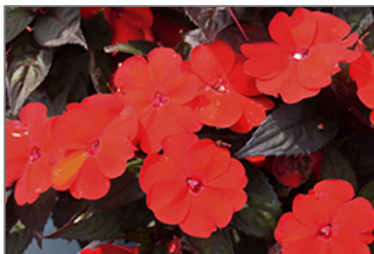
SunPatiens Compact Deep Red Impatiens flowers