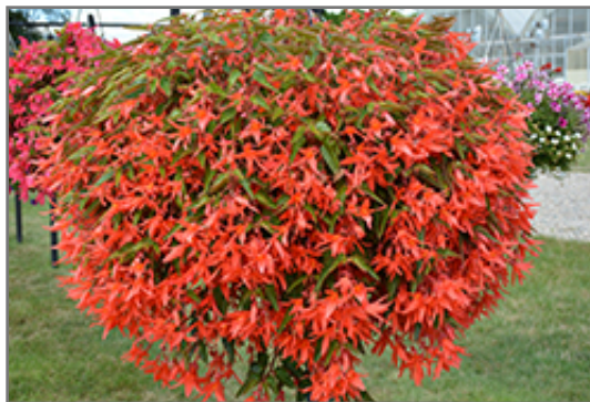
Beauvillia Dark Salmon Begonia in bloom