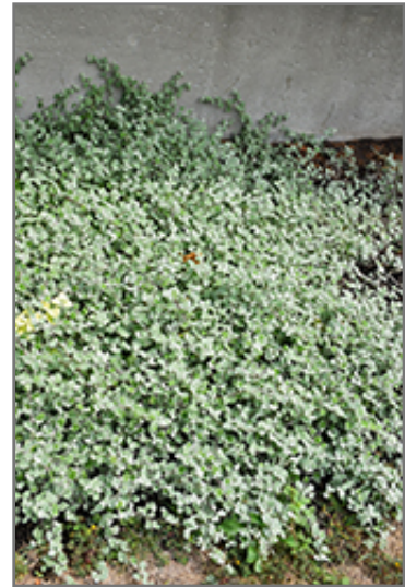
Silver Licorice Plant

Silver Licorice Plant is a fine choice for the garden, but it is also a good selection for planting in outdoor containers and hanging baskets. Because of its trailing habit of growth, it is ideally suited for use as a 'spiller' in the 'spiller-thriller-filler' container combination; plant it near the edges where it can spill gracefully over the pot. Note that when growing plants in outdoor containers and baskets, they may require more frequent waterings than they would in the yard or garden.