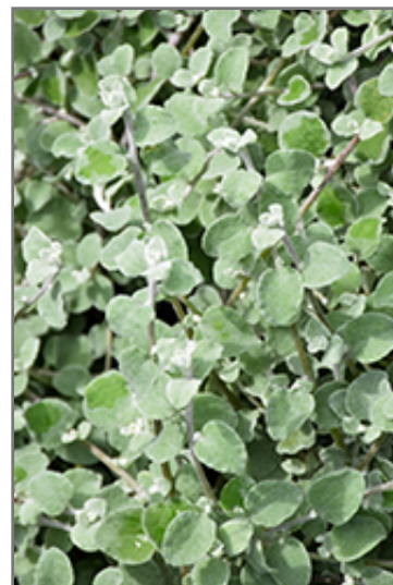
Silver Licorice Plant foliage