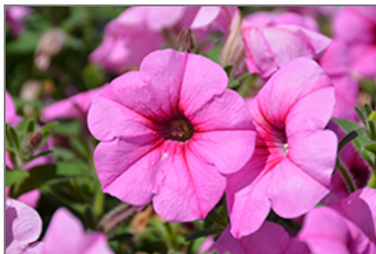
Durabloom Royal Pink Petunia flowers

Durabloom Royal Pink Petunia is recommended for the following landscape applications;