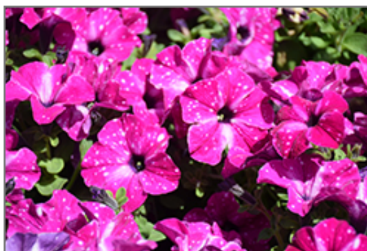
Headliner Enchanted Sky Petunia flowers