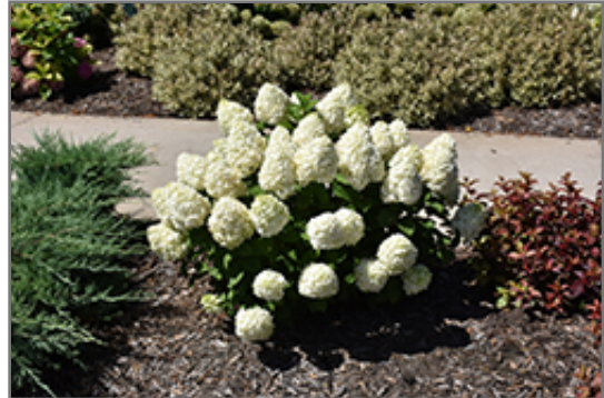
Little Lime Punch Hydrangea in bloom

Little Lime Punch Hydrangea makes a fine choice for the outdoor landscape, but it is also well-suited for use in outdoor pots and containers. With its upright habit of growth, it is best suited for use as a 'thriller' in the 'spiller-thriller-filler' container combination; plant it near the center of the pot, surrounded by smaller plants and those that spill over the edges. It is even sizeable enough that it can be grown alone in a suitable container. Note that when grown in a container, it may not perform exactly as indicated on the tag - this is to be expected. Also note that when growing plants in outdoor containers and baskets, they may require more frequent waterings than they would in the yard or garden.