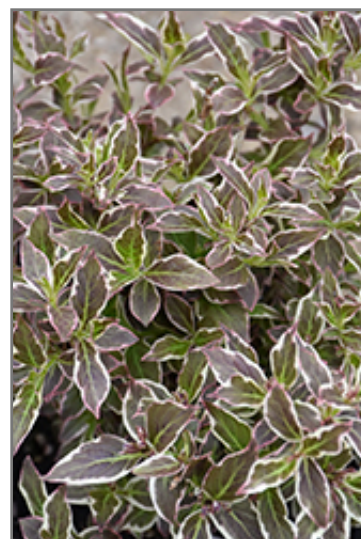
My Monet Purple Effect Weigela foliage