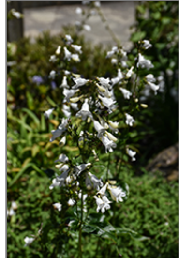
Foxglove Beardtongue flowers