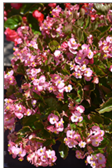
Hula Pink Begonia flowers