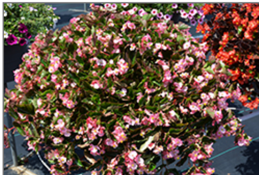
Hula Pink Begonia in bloom

Hula Pink Begonia is a fine choice for the garden, but it is also a good selection for planting in outdoor containers and hanging baskets. Because of its spreading habit of growth, it is ideally suited for use as a 'spiller' in the 'spiller-thriller-filler' container combination; plant it near the edges where it can spill gracefully over the pot. Note that when growing plants in outdoor containers and baskets, they may require more frequent waterings than they would in the yard or garden.