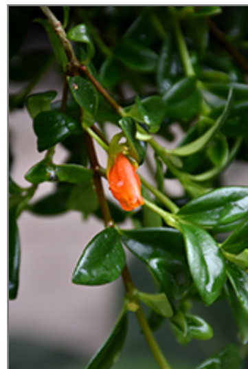
Goldfish Plant flowers

When grown indoors, Goldfish Plant can be expected to grow to be about 3 feet tall at maturity, with a spread of 3 feet. It grows at a slow rate, and under ideal conditions can be expected to live for approximately 10 years. This houseplant will do well in a location that gets either direct or indirect sunlight, although it will usually require a more brightly-lit environment than what artificial indoor lighting alone can provide. It does best in average to evenly moist soil, but will not tolerate standing water. The surface of the soil shouldn't be allowed to dry out completely, and so you should expect to water this plant once and possibly even twice each week. Be aware that your particular watering schedule may vary depending on its location in the room, the pot size, plant size and other conditions; if in doubt, ask one of our experts in the store for advice. It will benefit from a regular feeding with a general-purpose fertilizer with every second or third watering. It is not particular as to soil pH, but grows best in rich soil. Contact the store for specific recommendations on pre-mixed potting soil for this plant.