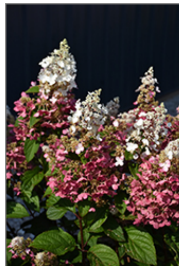
Pinky Winky Hydrangea flowers