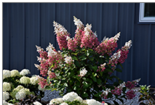
Pinky Winky Hydrangea in bloom