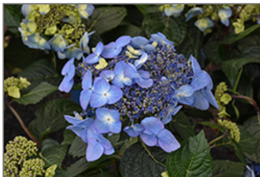
Endless Summer Pop Star Hydrangea flowers