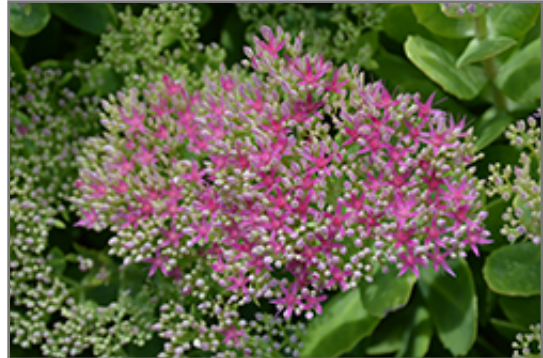
Neon Stonecrop flower buds

Neon Stonecrop is a fine choice for the garden, but it is also a good selection for planting in outdoor pots and containers. With its upright habit of growth, it is best suited for use as a 'thriller' in the 'spiller-thriller-filler' container combination; plant it near the center of the pot, surrounded by smaller plants and those that spill over the edges. Note that when growing plants in outdoor containers and baskets, they may require more frequent waterings than they would in the yard or garden.