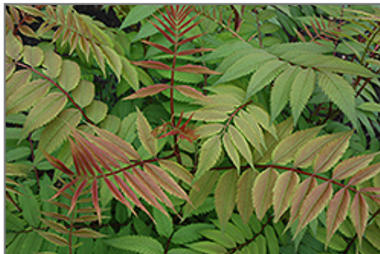
Sem False Spirea foliage