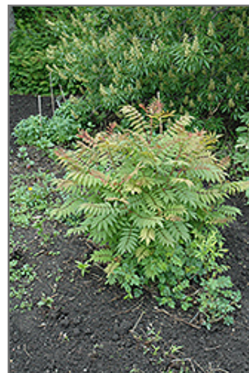
Sem False Spirea