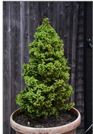
Rainbow's End Spruce