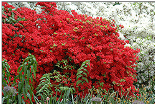
Stewartstonian Azalea in bloom