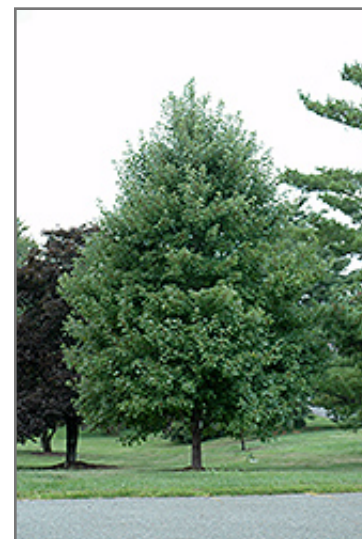
October Glory Red Maple