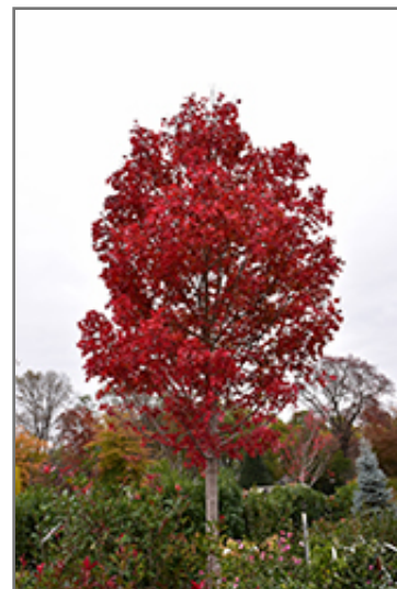
October Glory Red Maple in fall