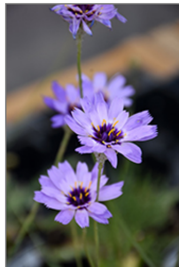
Cupid's Dart flowers