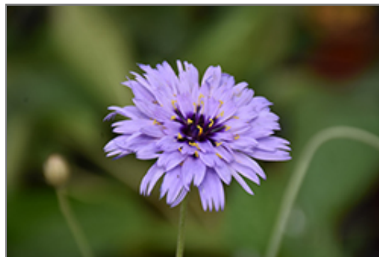
Cupid's Dart flowers