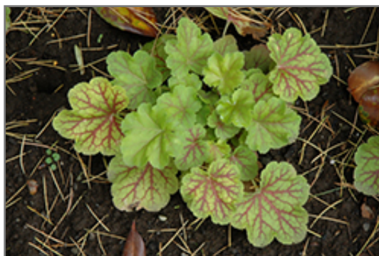
Electric Lime Coral Bells