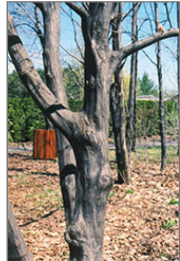
American Hornbeam bark

This tree performs well in both full sun and full shade. It is an amazingly adaptable plant, tolerating both dry conditions and even some standing water. It is not particular as to soil type or pH. It is somewhat tolerant of urban pollution. This species is native to parts of North America.