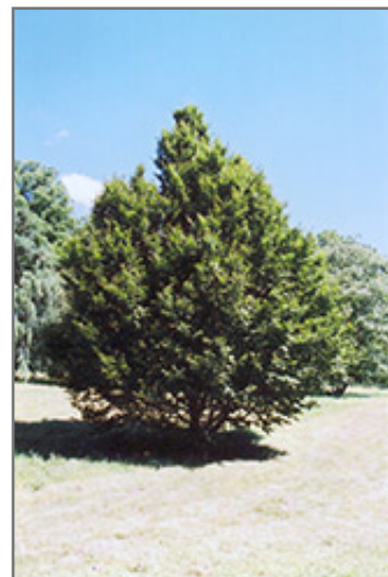
American Hornbeam