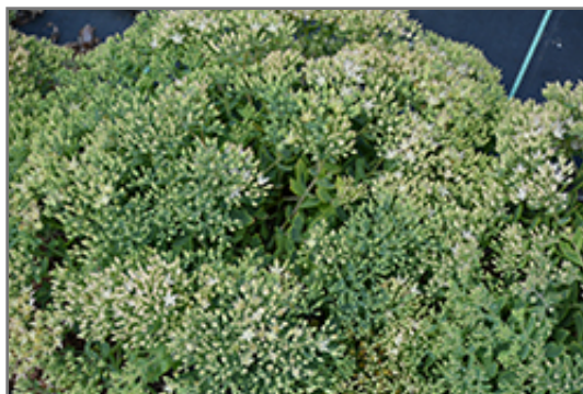
Thundercloud Stonecrop flower buds

Thundercloud Stonecrop is a fine choice for the garden, but it is also a good selection for planting in outdoor pots and containers. It is often used as a 'filler' in the 'spiller-thriller-filler' container combination, providing a mass of flowers and foliage against which the thriller plants stand out. Note that when growing plants in outdoor containers and baskets, they may require more frequent waterings than they would in the yard or garden.