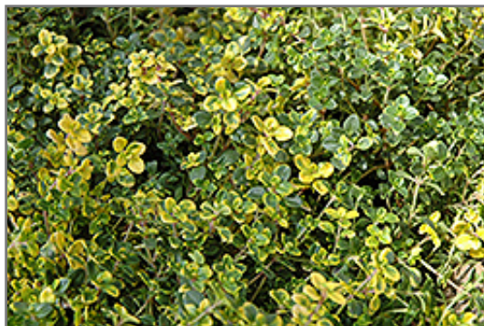
Doone Valley Thyme