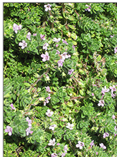
Pink Chintz Creeping Thyme flowers