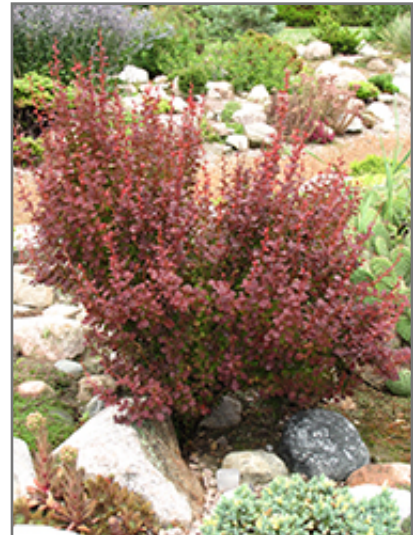
Orange Rocket Japanese Barberry

This shrub does best in full sun to partial shade. It is very adaptable to both dry and moist growing conditions, but will not tolerate any standing water. It is considered to be drought-tolerant, and thus makes an ideal choice for xeriscaping or the moisture-conserving landscape. It is not particular as to soil type or pH, and is able to handle environmental salt. It is highly tolerant of urban pollution and will even thrive in inner city environments. This is a selected variety of a species not originally from North America.