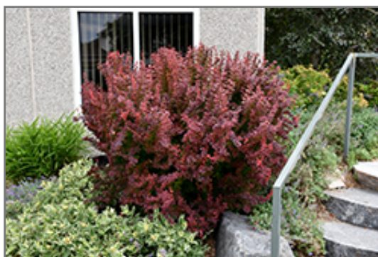
Orange Rocket Japanese Barberry