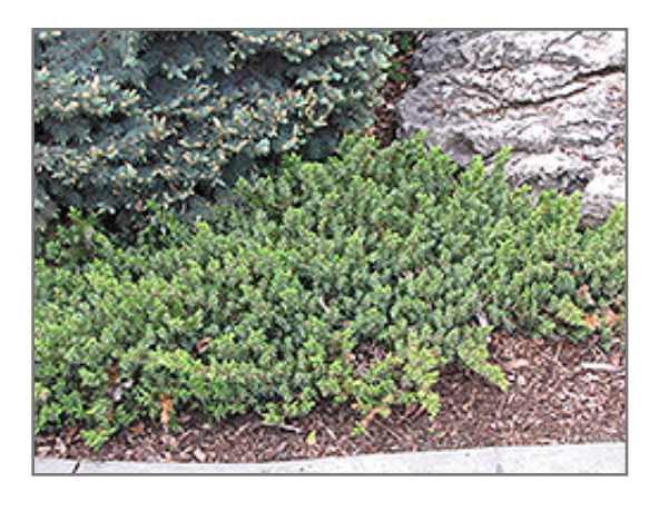
Dwarf Japanese Garden Juniper

This is a relatively low maintenance shrub, and is best pruned in late winter once the threat of extreme cold has passed. Deer don't particularly care for this plant and will usually leave it alone in favor of tastier treats. It has no significant negative characteristics.