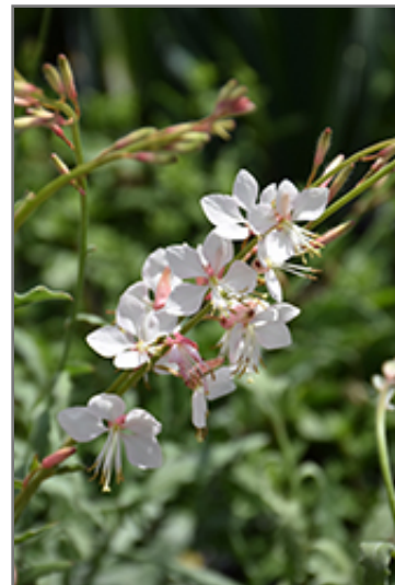
Whirling Butterflies Gaura flowers

Whirling Butterflies Gaura is recommended for the following landscape applications;