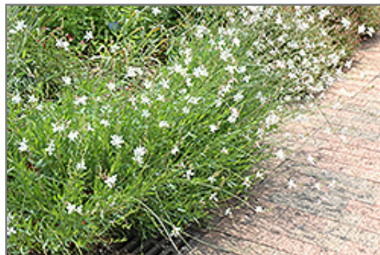
Whirling Butterflies Gaura in bloom