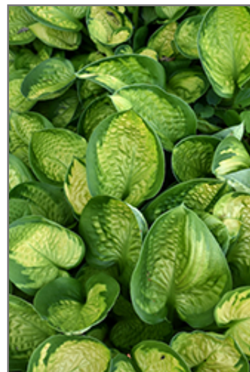
Rainforest Sunrise Hosta foliage

Rainforest Sunrise Hosta is recommended for the following landscape applications;