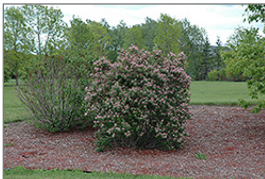
Honeyrose Honeysuckle in bloom