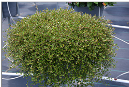
Wire Vine