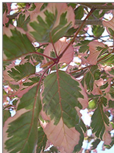
Tricolor Beech foliage