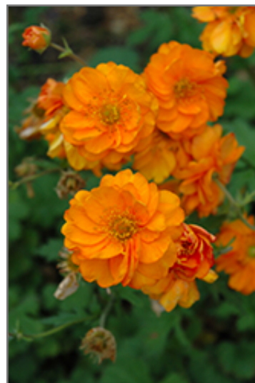
Fire Storm Avens flowers