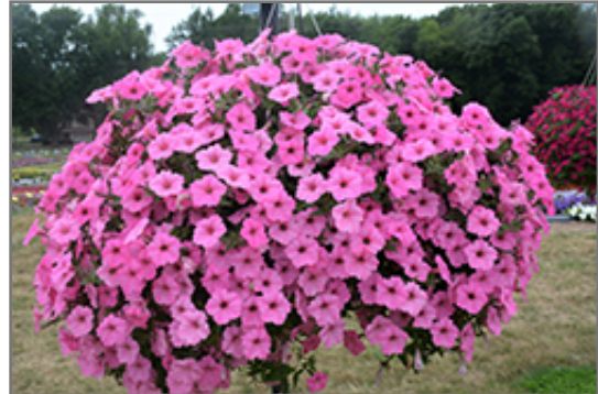
Supertunia Vista Bubblegum Petunia in bloom

Supertunia Vista Bubblegum Petunia is a fine choice for the garden, but it is also a good selection for planting in outdoor containers and hanging baskets. Because of its trailing habit of growth, it is ideally suited for use as a 'spiller' in the 'spiller-thriller-filler' container combination; plant it near the edges where it can spill gracefully over the pot. Note that when growing plants in outdoor containers and baskets, they may require more frequent waterings than they would in the yard or garden.