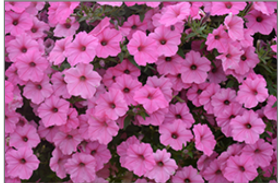
Supertunia Vista Bubblegum Petunia flowers