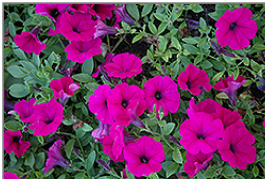
Wave Purple Classic Petunia flowers