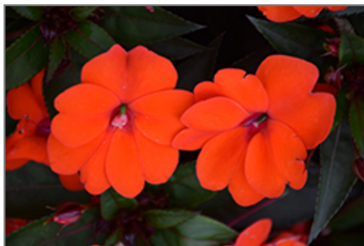
SunPatiens Compact Orange New Guinea Impatiens flowers

SunPatiens Compact Orange New Guinea Impatiens is recommended for the following landscape applications;