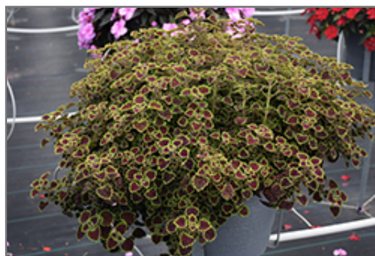
Burgundy Wedding Train Coleus