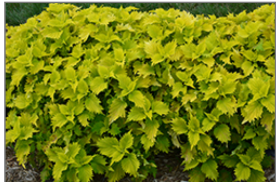
Wasabi Coleus