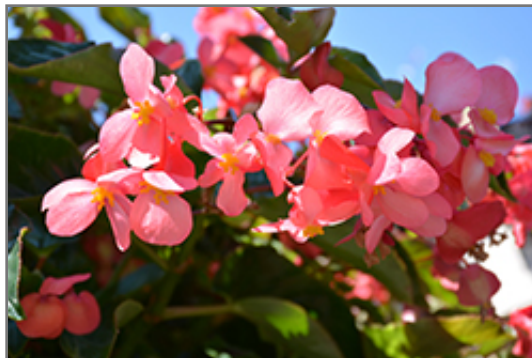
Dragon Wing Pink Begonia flowers