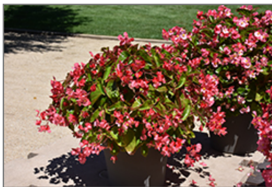
Dragon Wing Pink Begonia flowers