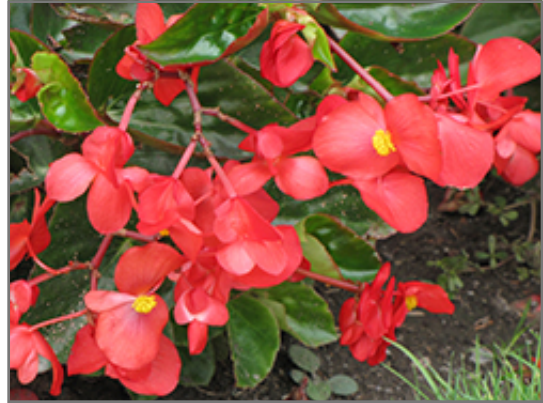
Dragon Wing Red Begonia flowers

This is a high maintenance plant that will require regular care and upkeep, and usually looks its best without pruning, although it will tolerate pruning. Deer don't particularly care for this plant and will usually leave it alone in favor of tastier treats. Gardeners should be aware of the following characteristic(s) that may warrant special consideration;