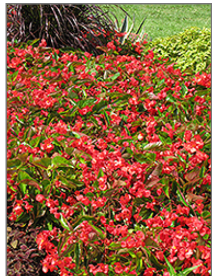
Dragon Wing Red Begonia in bloom