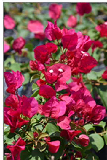
Barbara Karst Bougainvillea flowers