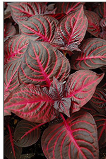
Blazin' Rose Blood Leaf foliage