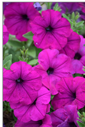
Easy Wave Violet Petunia flowers