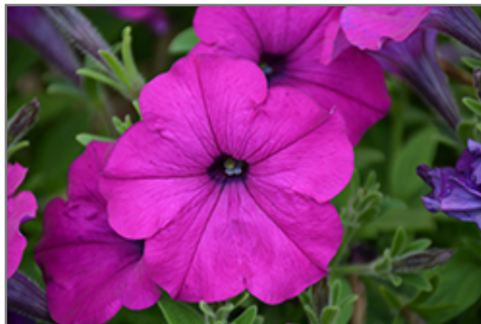
Easy Wave Violet Petunia flowers

Easy Wave Violet Petunia is recommended for the following landscape applications;