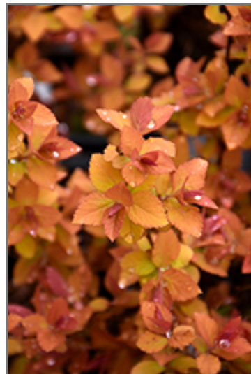
Double Play Big Bang Spirea foliage

This shrub should only be grown in full sunlight. It prefers to grow in average to moist conditions, and shouldn't be allowed to dry out. It is not particular as to soil type or pH. It is highly tolerant of urban pollution and will even thrive in inner city environments. This particular variety is an interspecific hybrid.